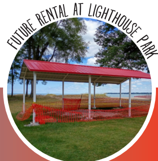
FUTURE RENTAL AT LIGHTHOUSE PARK