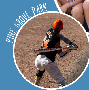
PINE GROVE PARK