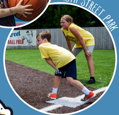
16TH STREET PARK